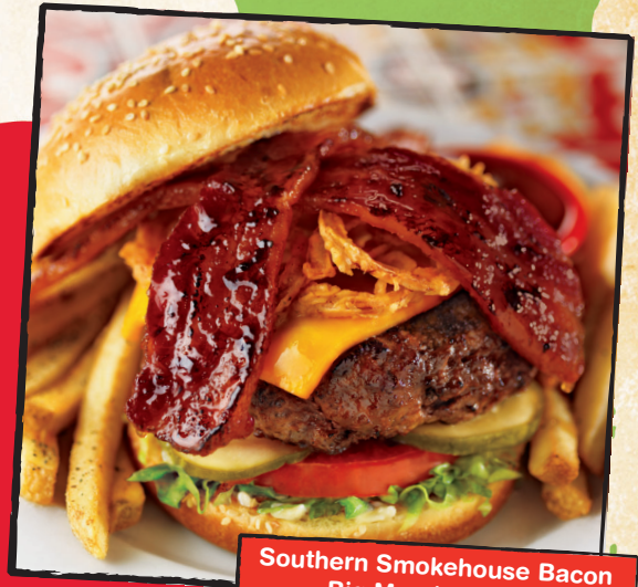
Southern Smokehouse Bacon Big Mouth Burger®

We look forward to seeing you here. Pepper in Some Fun!