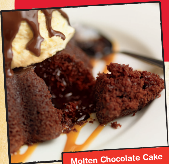
Molten Chocolate Cake